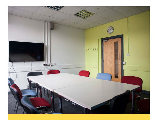
HALF DAY (9AM-12:30PM OR 1:30-5PM)

A boardroom space for up to eight people.